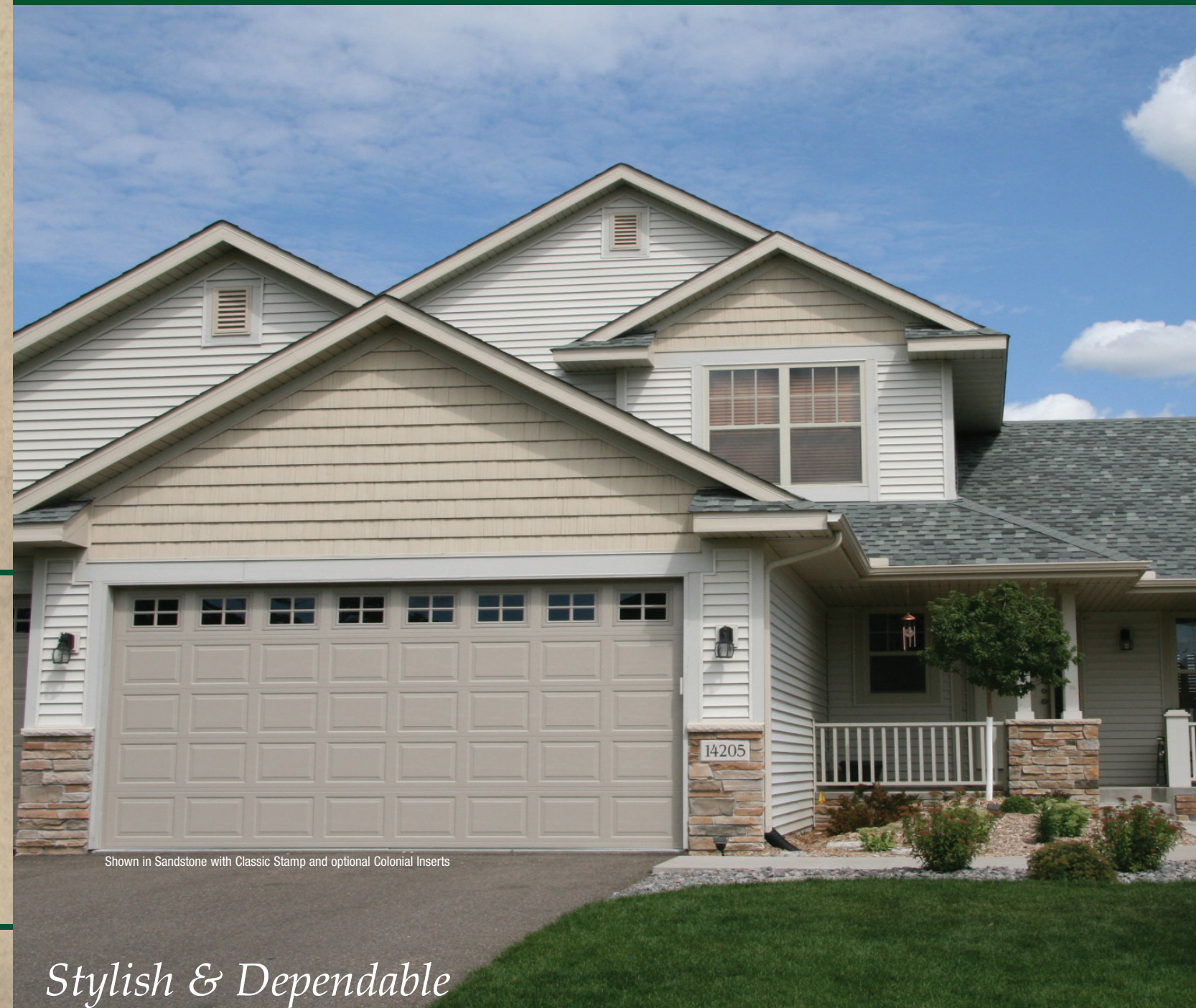
Shown in Sandstone with Classic Stamp and optional Colonial Inserts

RP-25, CT-24, TR-138, TR-2000, LP-138 & LP-II