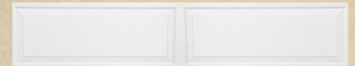
LONG PANEL Available in thermal models only