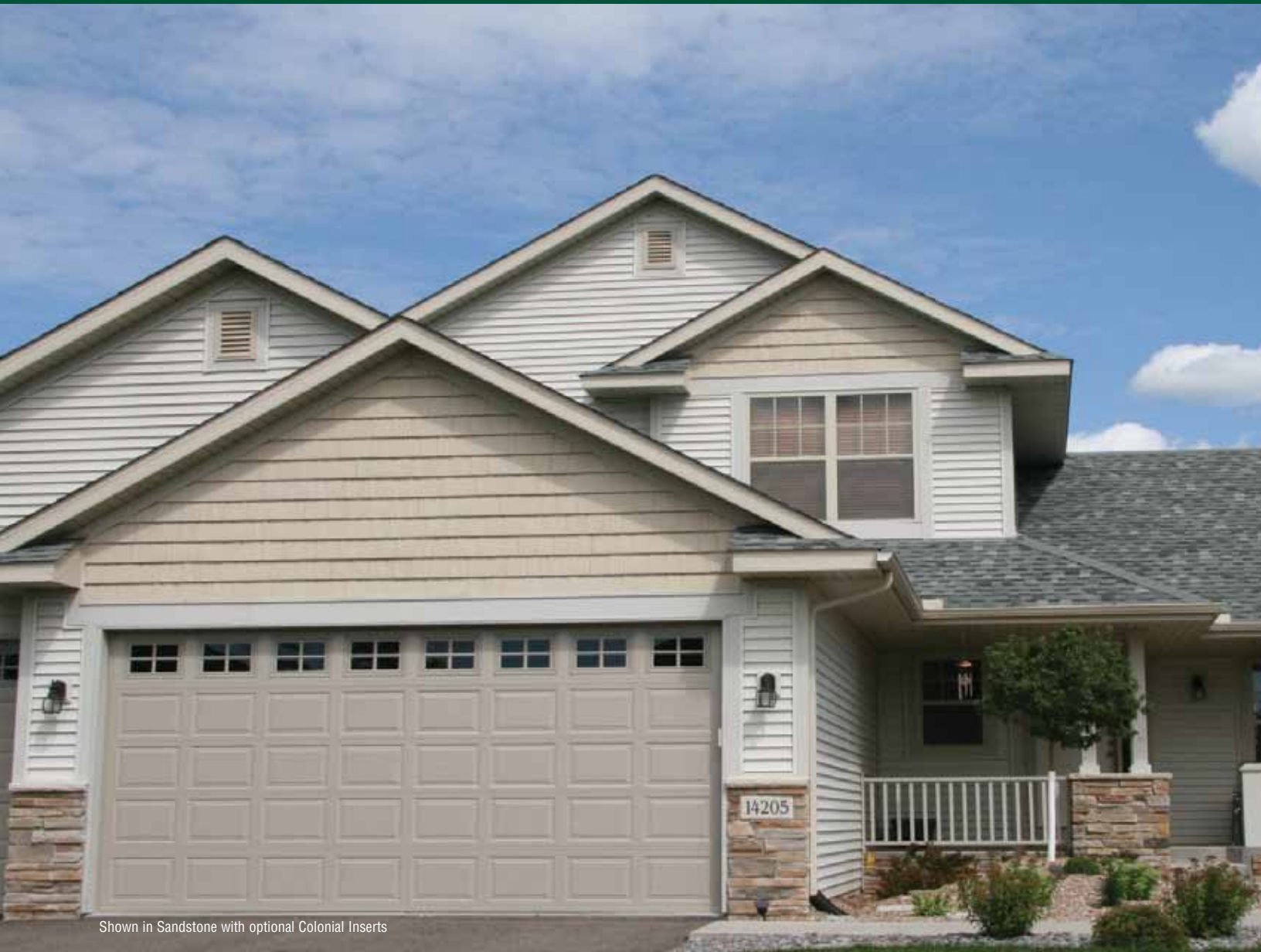
Shown in Sandstone with optional Colonial Inserts