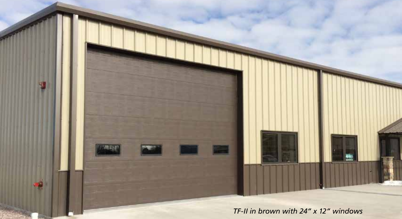
TF-II in brown with 24" x 12" windows

Available in flush or raised panel designs, our 2" medium-duty thermal doors offer a clean modern look for any building. Designed to combine thermal door dependability with contemporary design to provide you with a clean, crisp look and strong insulating performance.