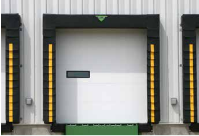
TF-II in white with 24" x 8" windows