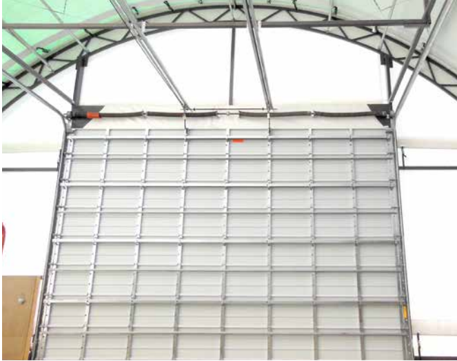
24 gauge interior