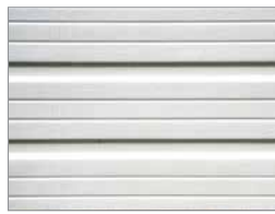
WOODGRAIN (25 gauge)