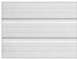
SMOOTH (24 gauge)