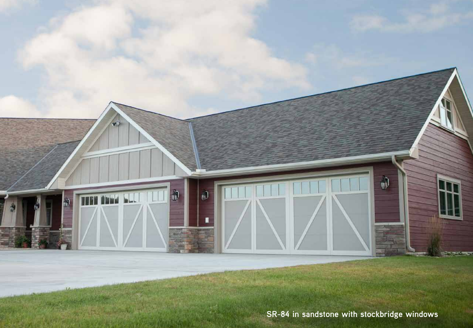
SR-84 in sandstone with stockbridge windows

With classic beauty, durability and thermal efficiency, your home will be