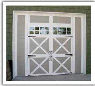
Custom Creation: Shown in Sandstone with Stockton windows