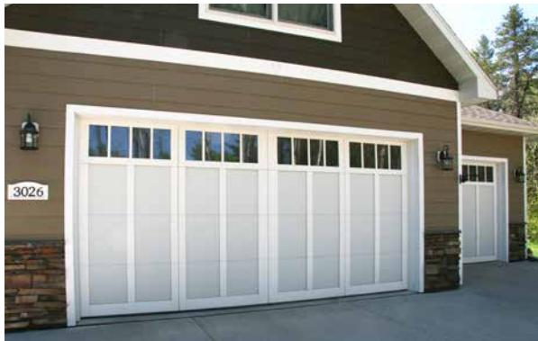
SR-82 in white with stockbridge windows