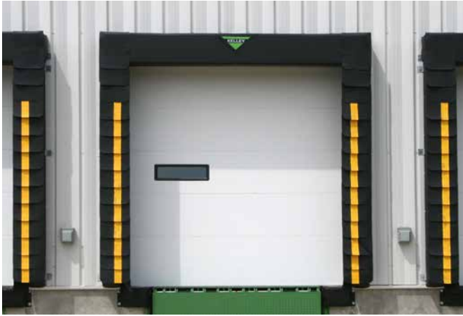
TF-II in white with 24" x 8" windows