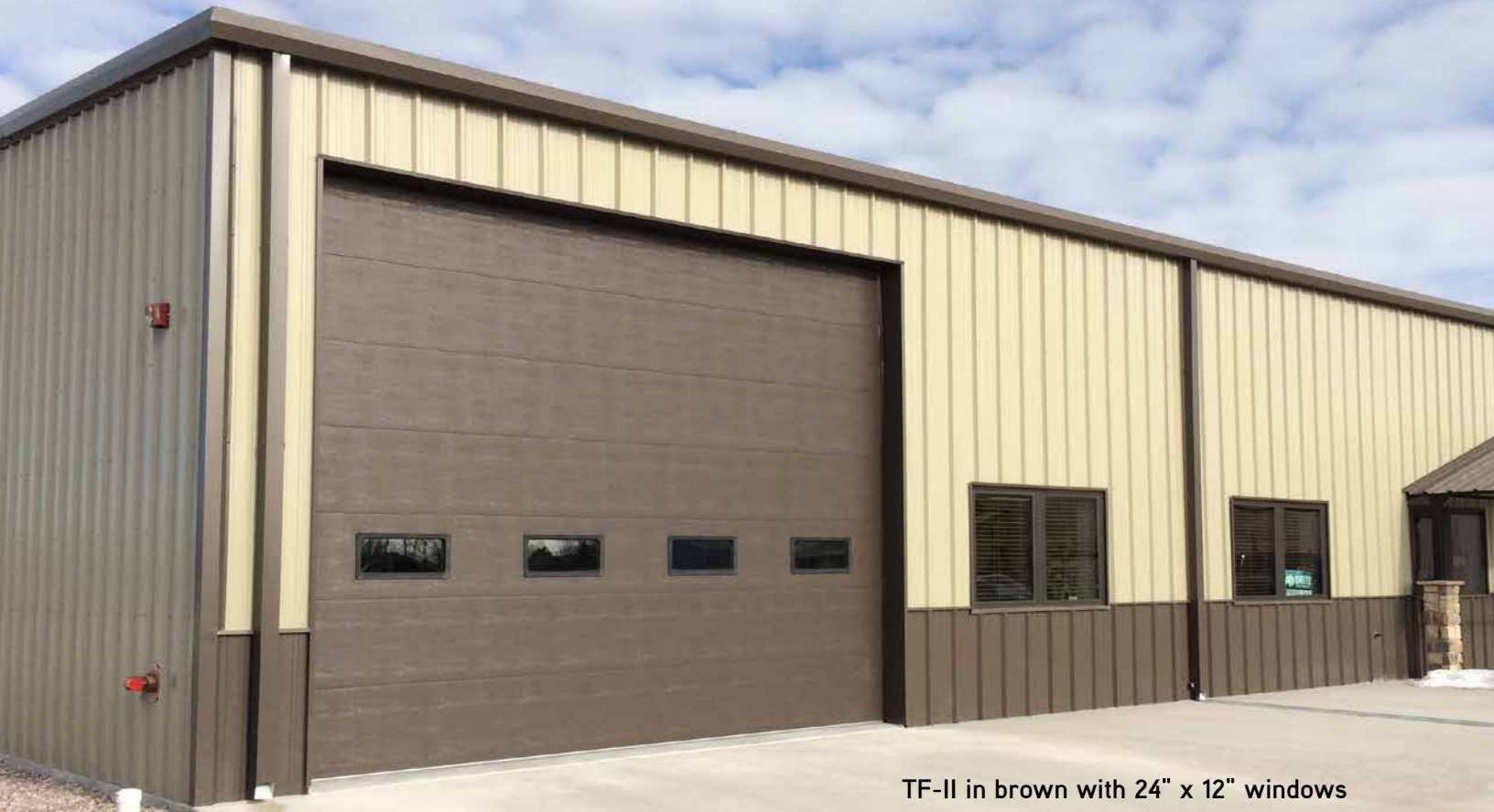
TF-II in brown with 24" x 12" windows

Available in flush or raised panel designs, our 2" medium-duty thermal doors offer a clean modern look for any building. Designed to combine thermal door dependability with contemporary design to provide you with a clean, crisp look and strong insulating performance.